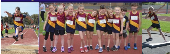
Little Athletics caters for children aged 5-17 and includes sprints, middle-distance running, hurdles, throws and jumps.